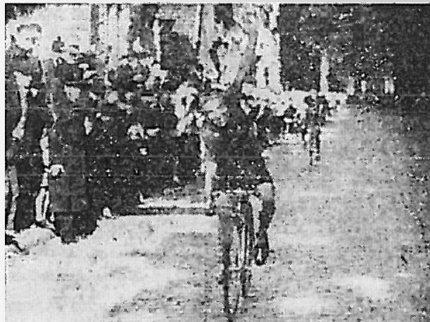
The nice victory in the sprint from Stan Ockers

Schoten, Kapellen, Kalmthout, Wuustwezel, Brecht, St. Lenaarts, Rijkevorsel, Hoogstraten, Wortel, Merksplas, Turnhout, Gierle, Lille, Wechelderzande, Vlimmeren, Oostmalle, Westmalle, Schilde, 'sGravenwezel, Schoten and three local laps through Brasschaat, total 160 km.